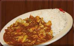
VEGGIE CURRY $ 8.99

Choice of one: Chicken, Pork, Beef. Or Tofu-add $ 1.00