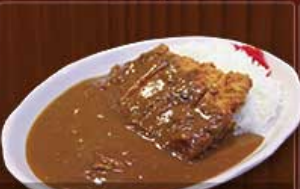
OUTLET CURRY $ 9.99