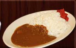
PLAIN CURRY $ 7.99