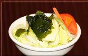
SMALL SALAD $ 2.00

Crisp lettuce and soft seaweed served with Mami's homemade soy dressing.