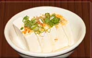
YAKKO $ 3.00

Fresh tofu with shavings of dried bonito, scallions and Mami's homemade soy dressing served with crisp lettuce.