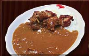
TATSUTA CURRY $ 9.99

Japanese style chicken and beef broth curry. Rich and Spicy! Served with a side salad and miso soup. Free refills of rice.