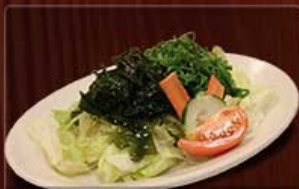
KAISOU SALAD $ 4.99

Mixed seaweed and soft seaweed served over crisp lettuce, served with Mami's homemade soy dressing.