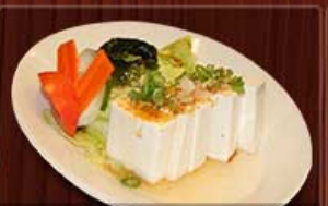
TOFU SALAD $ 4.99

Thin, juicy slices of beef pan-fried with fresh onions in Mami's unique spicy sauce served over crisp lettuce.