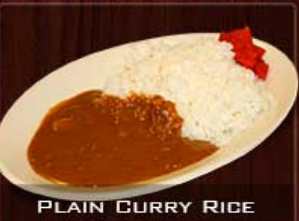
PLAIN CURRY RICE

(Chicken & Egg Rice Bowl) Tender slices of chicken and egg cooked with onions in Mami's sweetened soy sauce. Served over white rice.