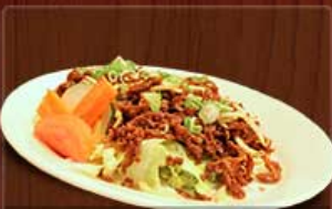
YAKINIKU SALAD $ 7.00

Mixed seaweed and soft seaweed served over crisp lettuce, served with Mami's homemade soy dressing.