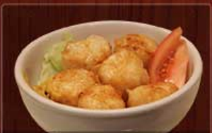
FRIED SHUMAI $ 4.50

Crisp lettuce and soft seaweed served with Mami's homemade soy dressing.