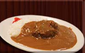
HAMBURG CURRY $ 9.99

Choice of one: Chicken, Pork, Beef. Or Tofu-add $ 1.00