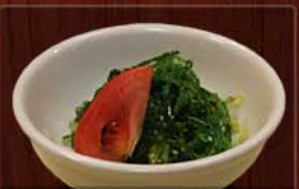
KAISOU $ 3.00

Fresh tofu with shavings of dried bonito, scallions and Mami's special ginger sauce.